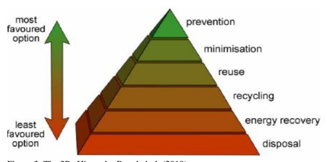
Figure 3: The 3Rs Hierarchy Bangladesh (2010).